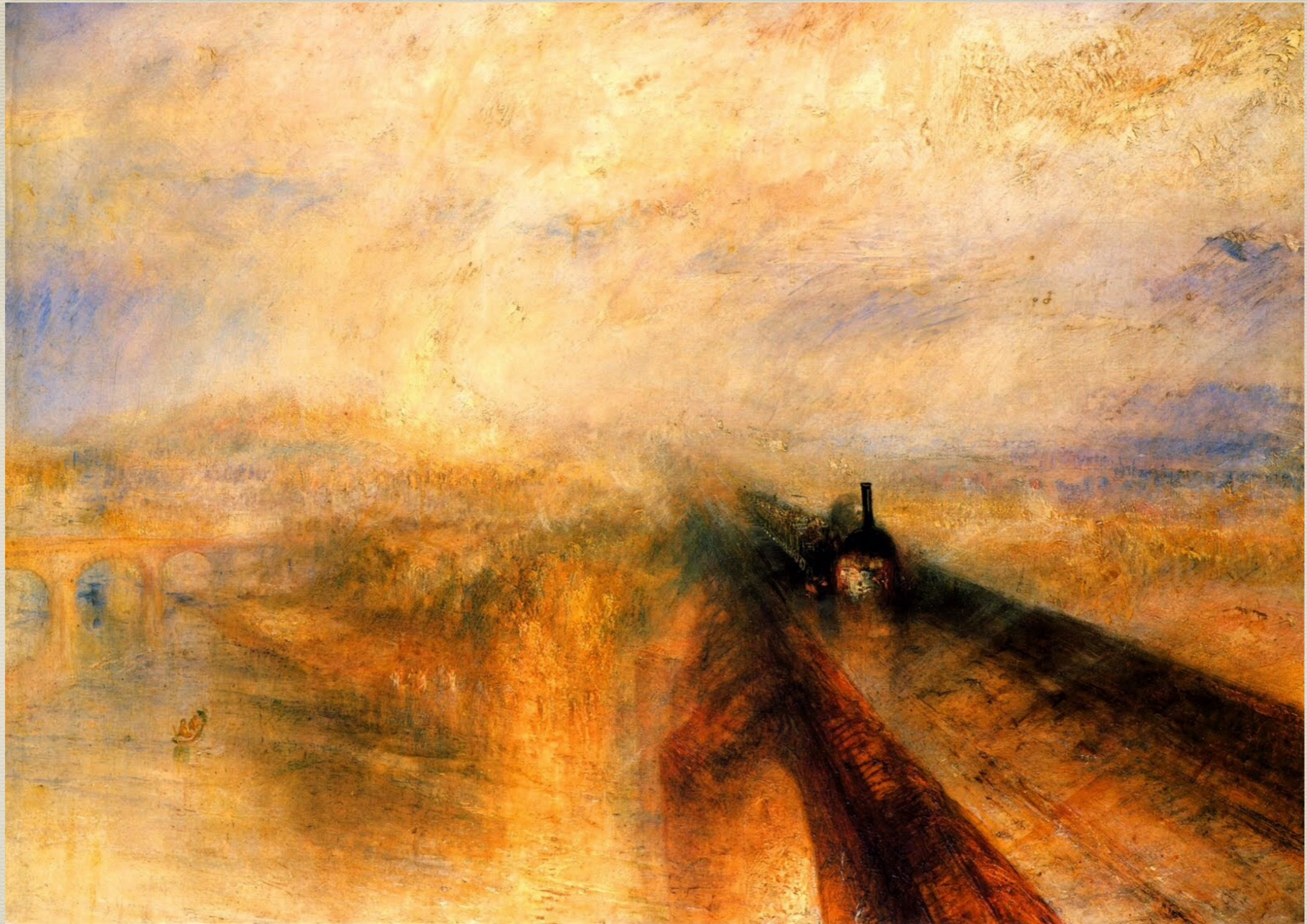
Rain, Steam and Speed by William Turner