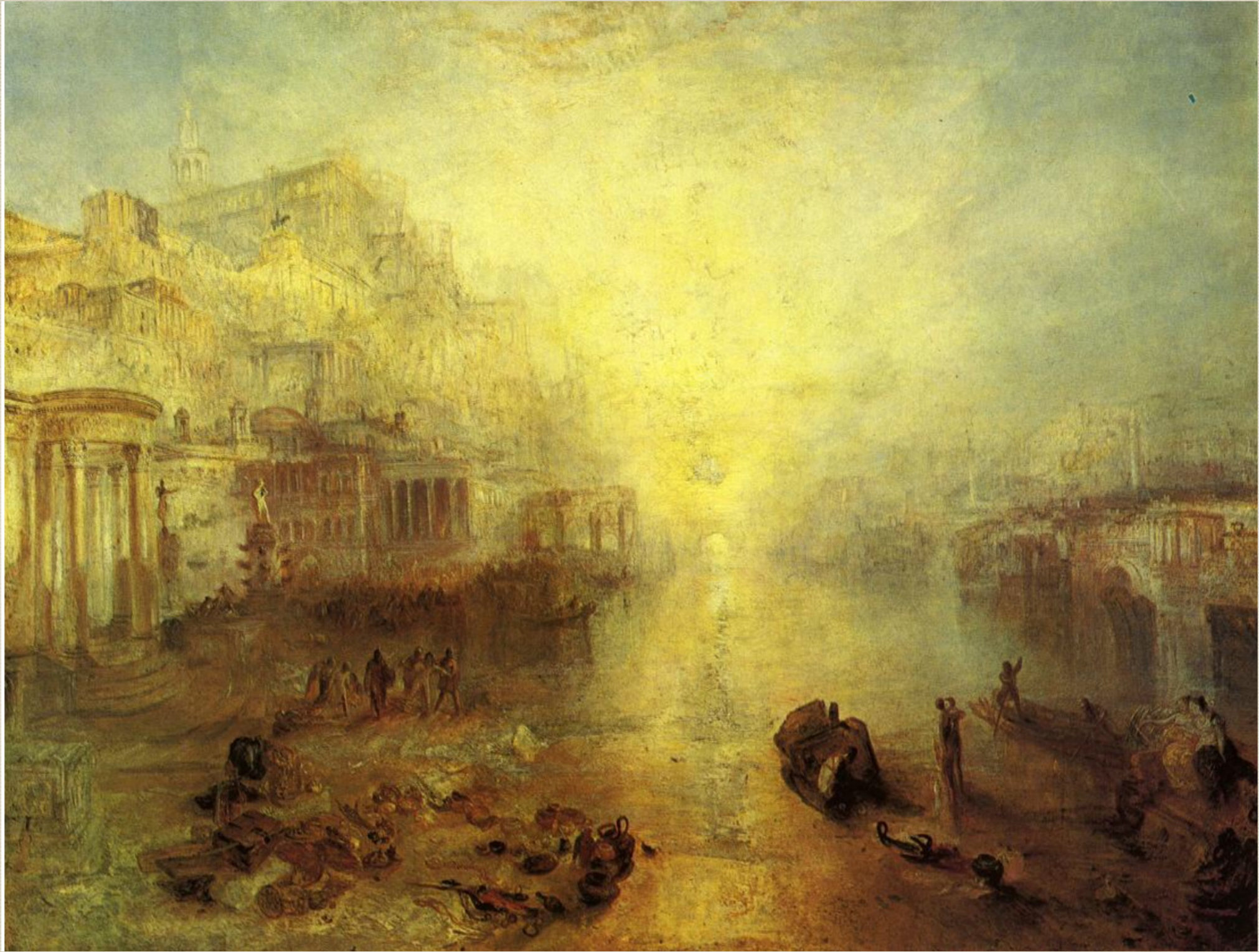
Ovid Banished from Rome by William Turner