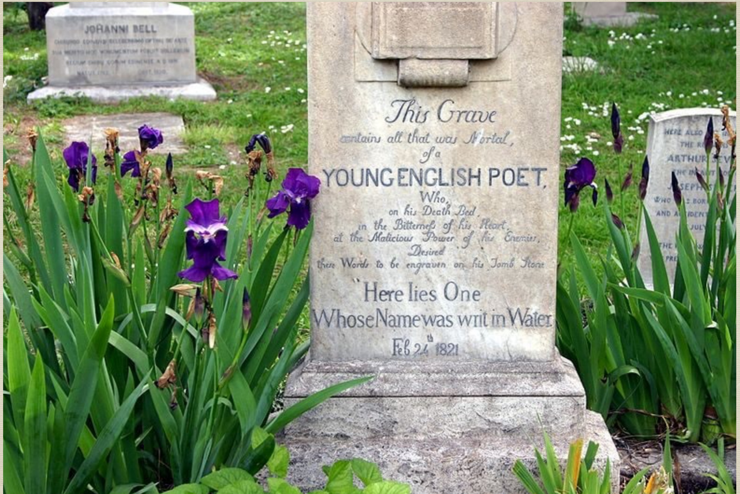
John Keats' grave in Rome