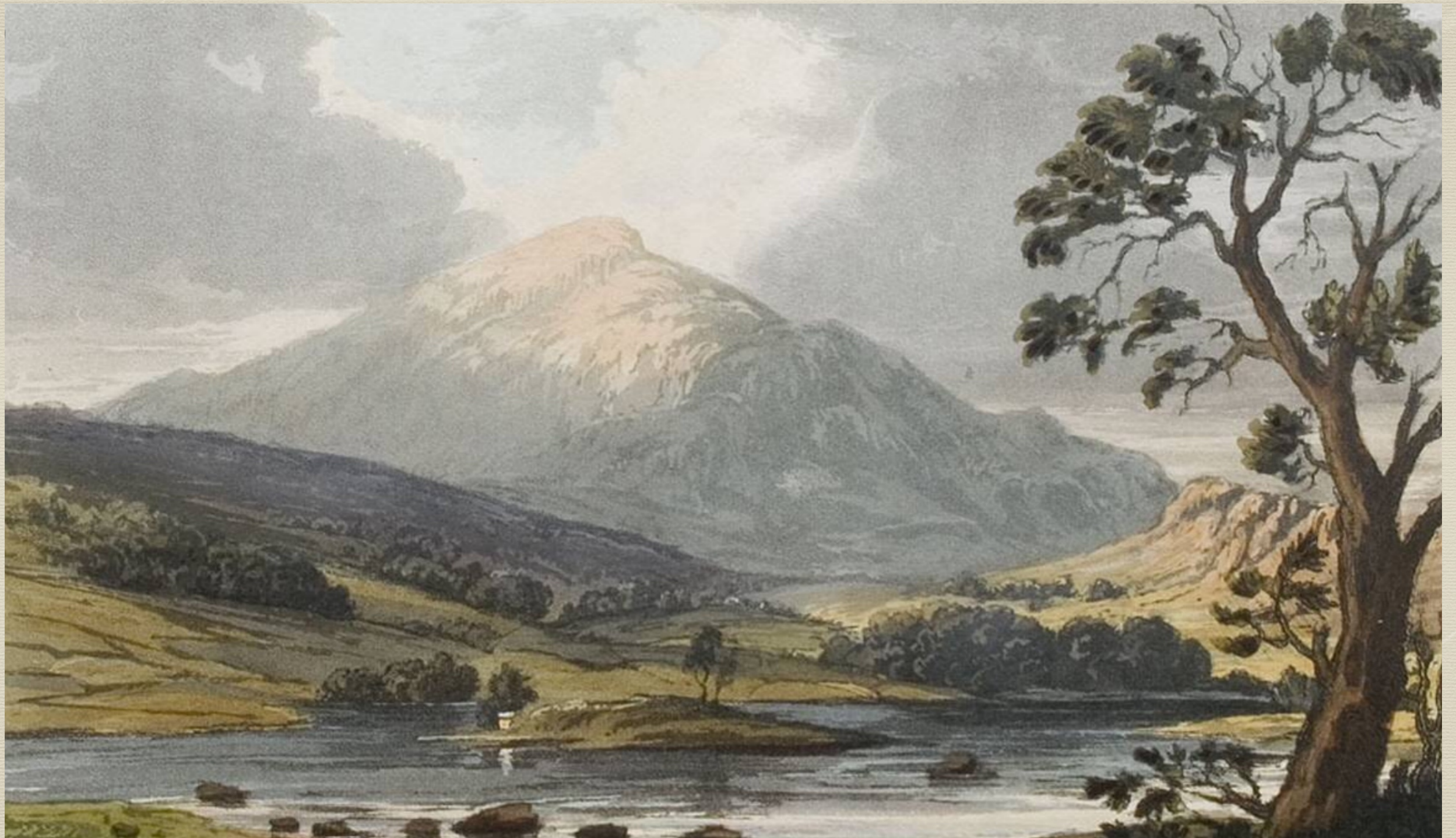
Painting of a landscape in the Lake District